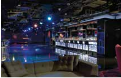
Bliss Ultra Lounge

The openness of this grand space invites you to linger with coffee, tea or the beverage of your choice and enjoy the fun of our two-story Wii™ screen. Seating capacity 90 (5,219 sq. ft.) (485 m 2 )