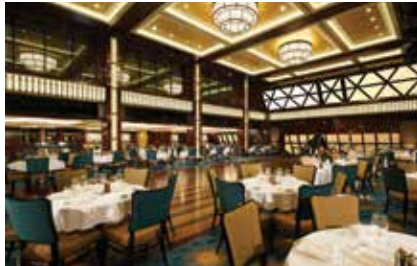
The Manhattan Room

Reminiscent of an elegant New York City supper club with music, dancing and entertainment. Don't miss the Burn the Floor dance troupe when they heat things up. Seating capacity 630 (13,041 sq. ft.) (1,212 m 2 )