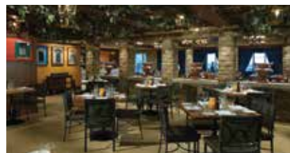
La Cucina Italian Restaurant

Sushi, sashimi and rolls artfully prepared and presented as you watch. Seating capacity 49 (958 sq. ft.) (89 m 2 )