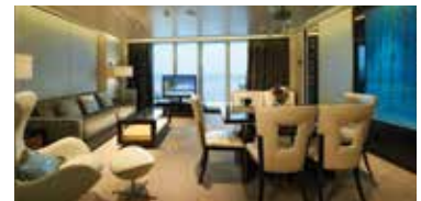
The Haven Deluxe Owner's Suite with Large Balcony