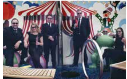
The Second City ®

For sidesplitting fun, make your way to Headliners Comedy Club for the brilliant improv of The Second City®. This is the world's premier comedy club/theater and school of improvisation, and their list of famous alumni include Alan Arkin, Joan Rivers, Robert Klein and Saturday Night Live alumni Tina Fey. Specializing in sketch comedy and improv, they have been making audiences laugh for over 50 years, and Norwegian Cruise Line is proud to be their exclusive cruise line partner.