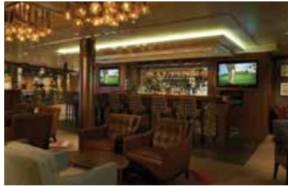
Maltings Beer & Whiskey Bar

Sit starboard, right alongside the sea where the view is intoxicating. Good times flow indoors, too. Seating capacity 70 (2,367 sq. ft.) (220 m 2 )