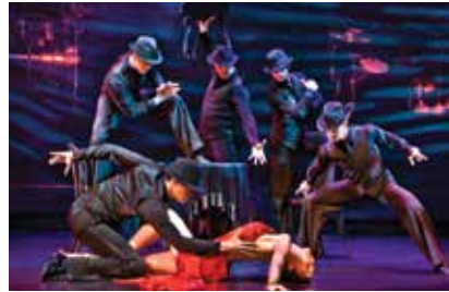
Burn the Floor ®

"Audience-dazzling! Swiveling hips, steamy embraces and high-octane tempos," raved The New York Times . Sizzling and sexy, Burn the Floor ® is a nonstop ballroom dance extravaganza based on the world-renowned Broadway show, featuring pop variations of the greatest dance styles all time, from Lindy, Foxtrot and Charleston to Cha-Cha, Rumba and Salsa.