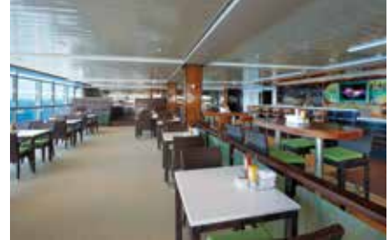
Uptown Bar & Grill

A premiere cigar shop and cigar lounge where patrons can light up in classic comfort. Seating capacity 15 (484 sq. ft.) (45 m 2 )