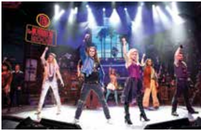
Rock of Ages