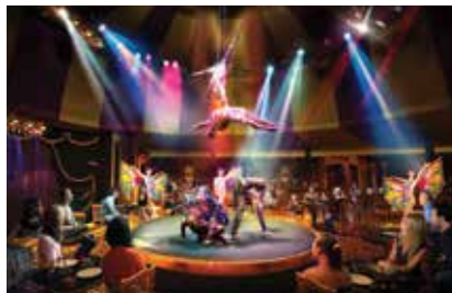
Cirque Dreams ™ & Dinner Jungle Fantasy

New York Magazine calls Cirque Dreams ™ & Dinner Jungle Fantasy "the grandest circus spectacular east of Vegas." There's nothing tame about this mind-blowing Broadway show, featuring mesmerizing acrobatics, eye-popping effects and fantastical costumes. Enjoy this must-see performance, along with a delicious multi-course dinner, in the Spiegel Tent.