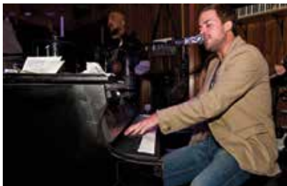
Howl at the Moon

For a big dose of feel-good, sing-along fun, nothing beats Howl at the Moon. Witness an electrifying blaze of ebony and ivory going head to head – while the audience instantly transforms into one giant happy wave of camaraderie. It's the World's Greatest Rock-'n'-Roll Dueling Piano Show. It's contagious and unlike anything else at sea.