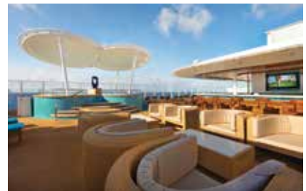
Vibe Beach Club

A full liquor bar adjacent to the pool area and within arm's reach of a great burger and fries. Swimsuits welcome. Seating capacity 144 (4,347 sq. ft.) (404 m 2 )