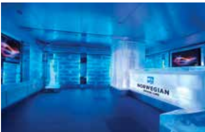
SVEDKA & Inniskillin Ice Bar

Your face will hurt from smiling but the pain is worth it. Join the fun with the sketch comedy and hilarious improvisation of The Second City®. Seating capacity 242 (3,228 sq. ft.) (300 m 2 )