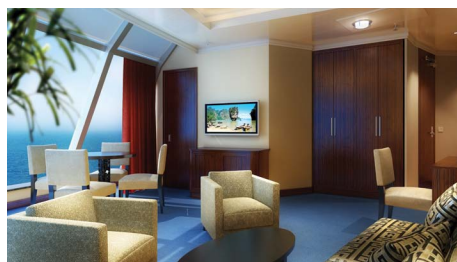
Deluxe Owner's Suite