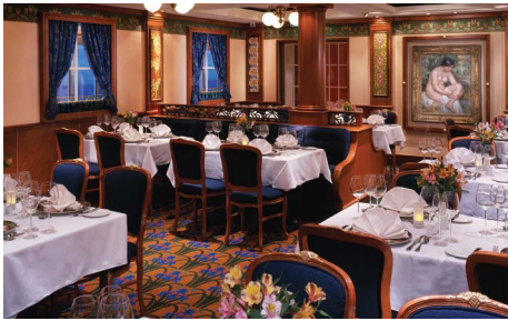
Le Bistro French Restaurant

This is our signature gourmet French restaurant where new tastes mingle with classic dishes for really exciting results. Seating capacity 86 (1,184 sq. ft.) (110 m 2 )