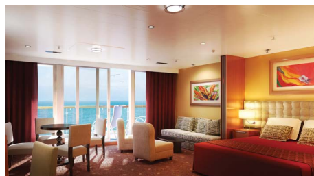
2-Bedroom Family Suite with Balcony