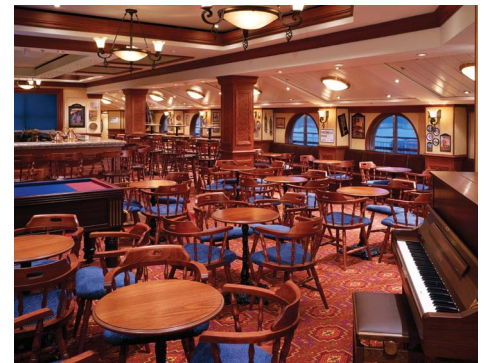
The Pearly Kings Pub

Make a splash at this poolside bar serving the latest cocktails. Seating capacity 224