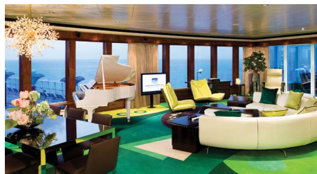
The Haven 3-Bedroom Garden Villa Living Room