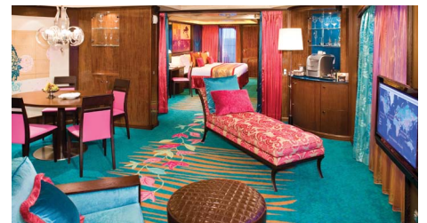
The Haven Owner's Suite with Large Balcony