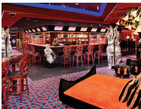
Bliss Ultra Lounge & Night Club

Seating capacity 84 (3,907 sq. ft.) (363 m 2 )