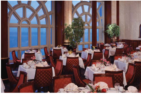
Windows Main Dining Room

This dining room offers five-course feasts, an amazing wine menu and to-die-for desserts. Seating capacity 530 (7,700 sq. ft.) (715 m 2 )