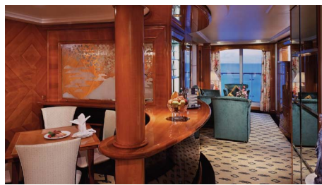
Aft-Facing Owner's Suite with Large Balcony