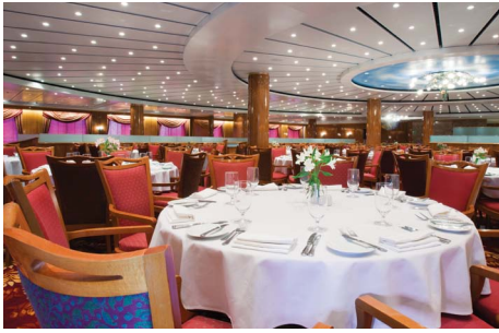
Four Seasons Main Dining Room

You'll love this dining room's five-course feasts, amazing wine menu and to-die-for desserts. Seating capacity 524 (11,000 sq. ft.) (1,022 m 2 )