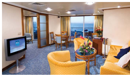
Owner's Suite with Large Balcony